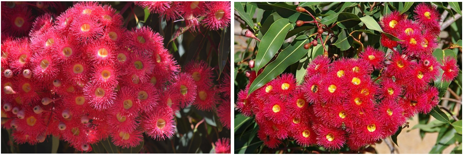
Pingelly's very own red flowering gums

Did you know Department of Fire and Emergency Services responded to 297 bushfires in April 2020? During the Djeran season it's important to remain vigilant and informed on emergency updates.