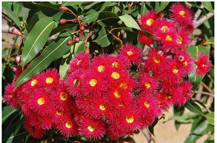
Pingelly's very own red flowering gums