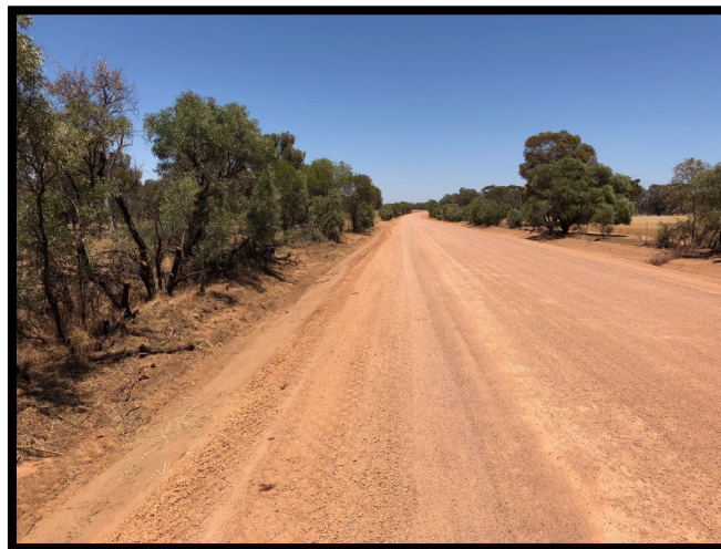
Zig Zag Road