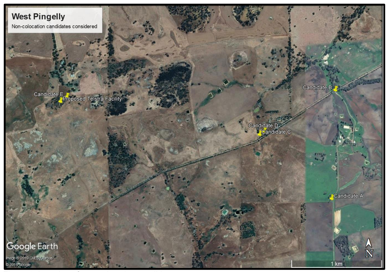
Figure 2: Location of non-colocation candidates

A preferred nominated candidate was selected for the proposed facility based on the radiofrequency objectives, property tenure, planning and environmental issues, potential community sensitive uses and engineering criteria as noted above. For this project, co-location on an existing telecommunications facility is not possible and a new macro tower is considered suitable given: