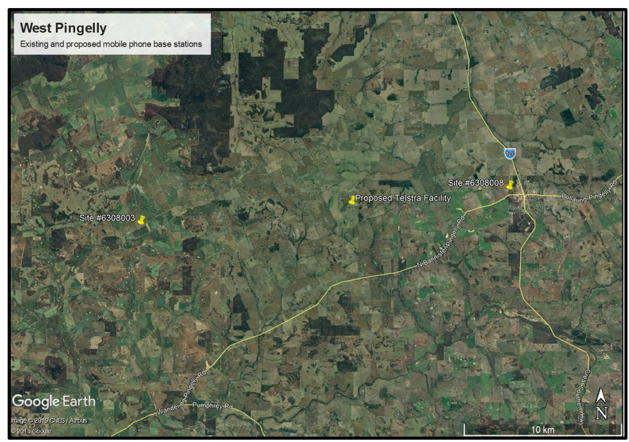
Figure 1: Location of nearby existing and proposed telecommunications facilities.

The map shows two (2) nearby sites 10km east and 13.38km west from the proposed location (Figure 1).